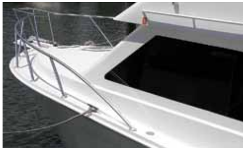
Yacht Quality Glass